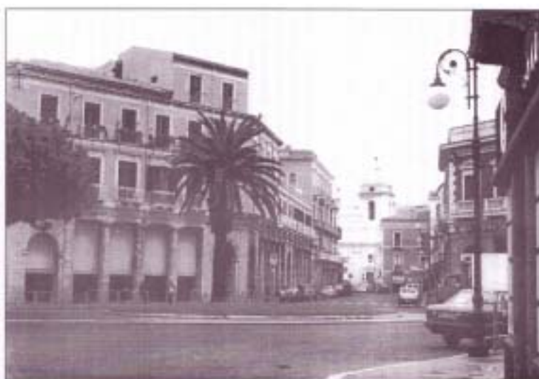
Cotrone: Piazza Vittoria. The former “Concordia” was in the three-balconied building at the corner by the Cathedral